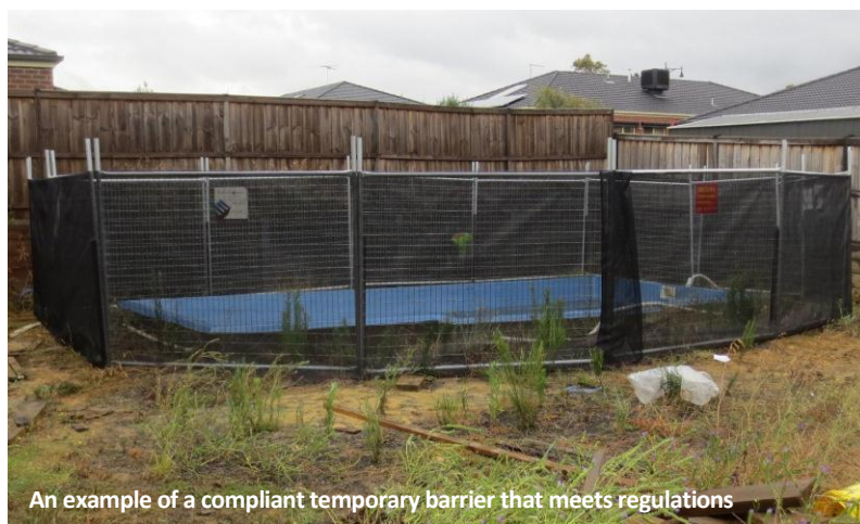
An example of a compliant temporary barrier that meets regulations