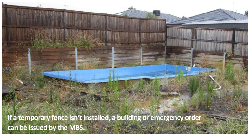
If a temporary fence isn't installed, a building or emergency order can be issued by the MBS.