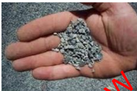
Illustration 2: Quarter minus bedding material

Historically, plumbers have bedded drains in materials (quarter minus) with a nominal size of a quarter of an inch, or approximately 6mm. As these products have stood the test of time, the VBA will continue to accept the use of such materials, provided they appear consistent in size upon visual inspection, as shown in the Illustration 2 below.