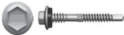
FIGURE 3 – EXAMPLE OF SELF DRILLING HEX HEAD SCREW